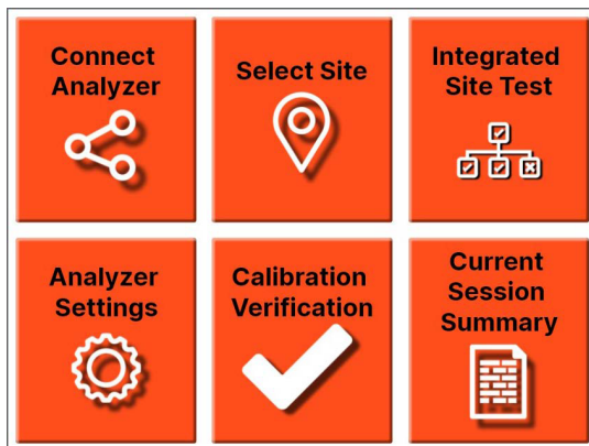
PRM Program Selections